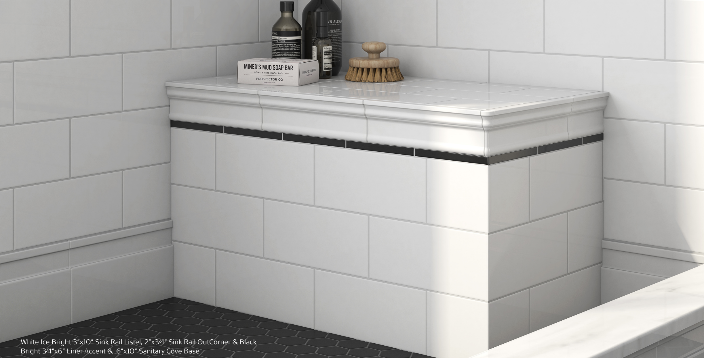
White Ice Bright 3"x10" Sink Rail Listel, 2"x3/4" Sink Rail OutCorner & Black Bright 3/4"x6" Liner Accent & 6"x10" Sanitary Cove Base