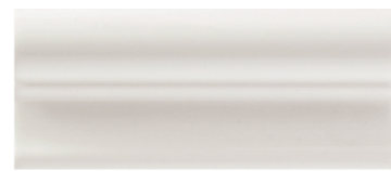
Snow White Bright 2 1/2"x6" Victorian Chair Rail