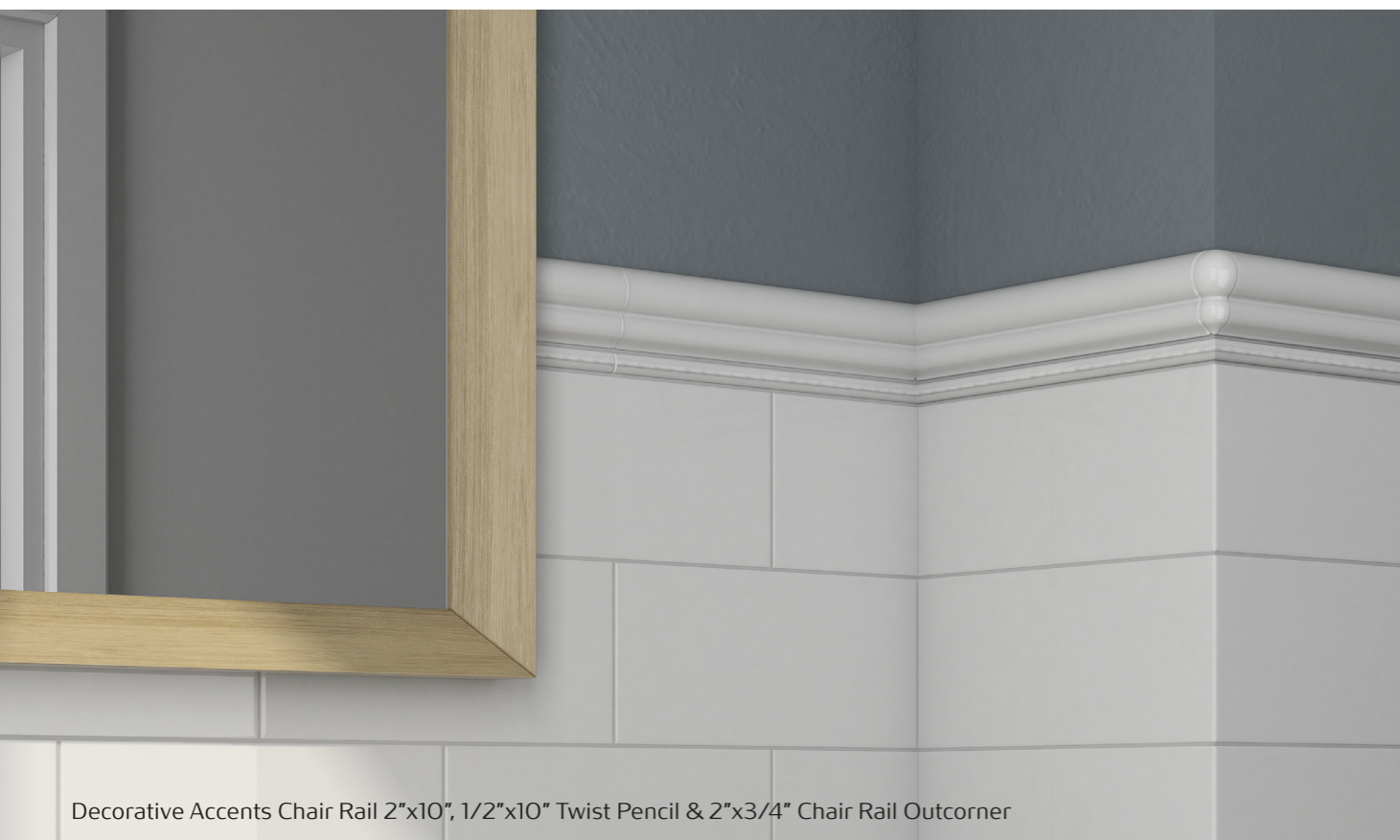
Decorative Accents Chair Rail 2"x10", 1/2"x10" Twist Pencil & 2"x3/4" Chair Rail Outcorner