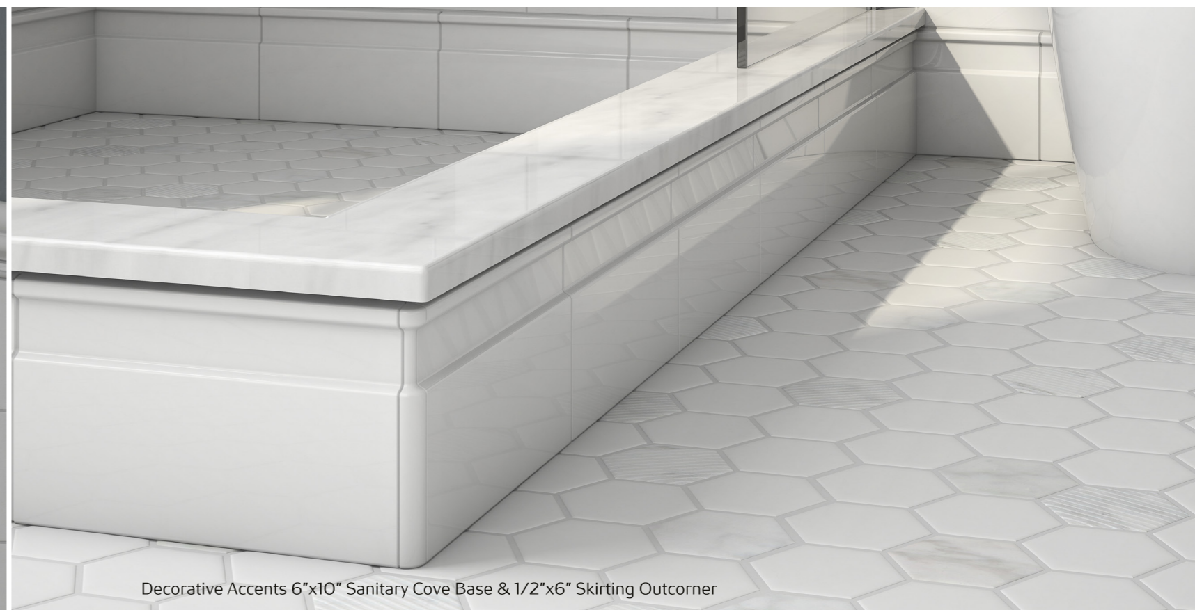
Decorative Accents 6"x10" Sanitary Cove Base & 1/2"x6" Skirting Outcorner