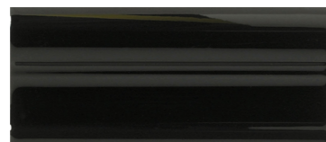
Black Bright 2 1/2"x6" Victorian Chair Rail