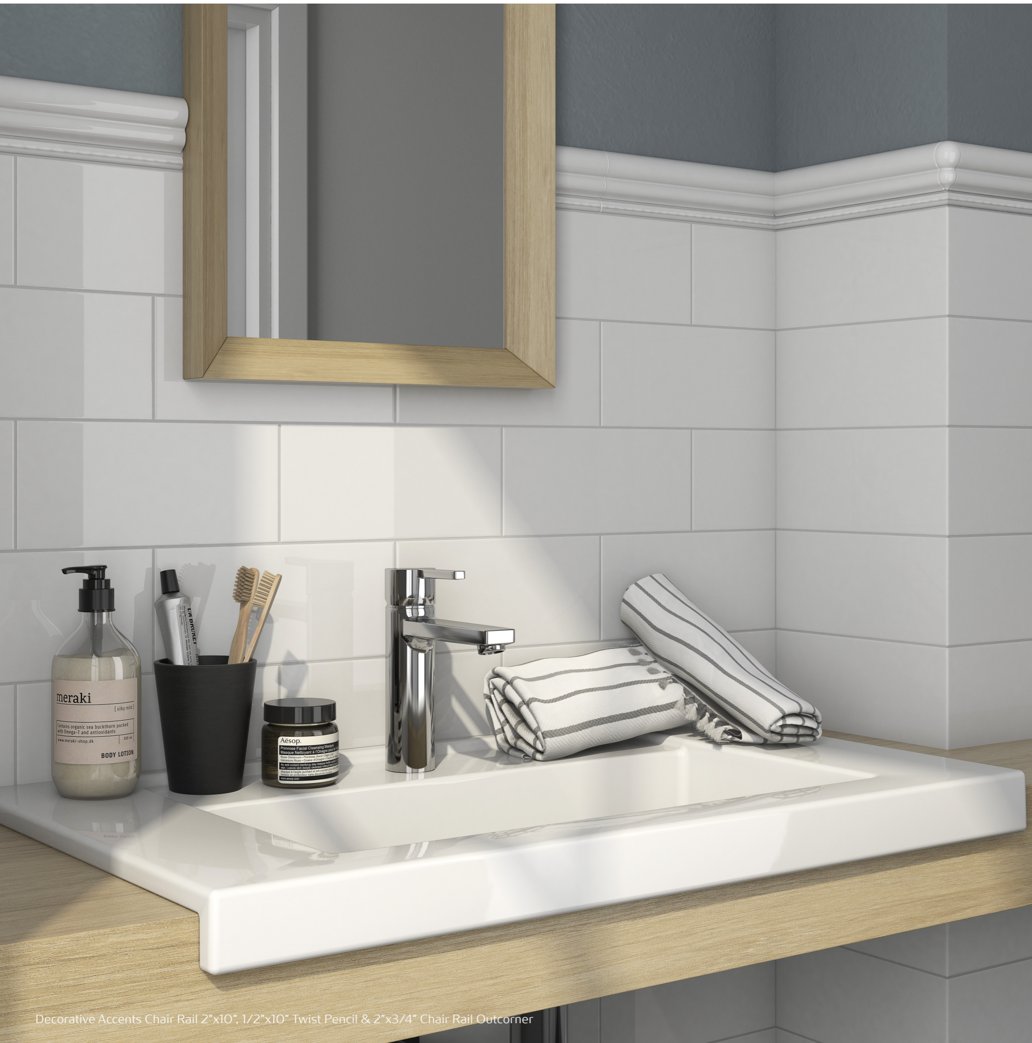
Decorative Accents Chair Rail 2"x10", 1/2"x10" Twist Pencil & 2"x3/4" Chair Rail Outcorner

Add a more elaborate finish to any space with our Decorative Accents collection. Made to coordinate with our Color Collection, this series is ideal for any bathroom or kitchen project. Get creative, mix and match, your design possibilities have no limit.