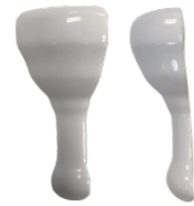
White Ice Bright 2"x3/4" Sink Rail OutCorner