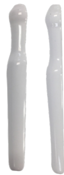
White Ice Bright 1/2"x6" Skirting OutCorner